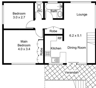
Ground Floor = 56.4 Sq M